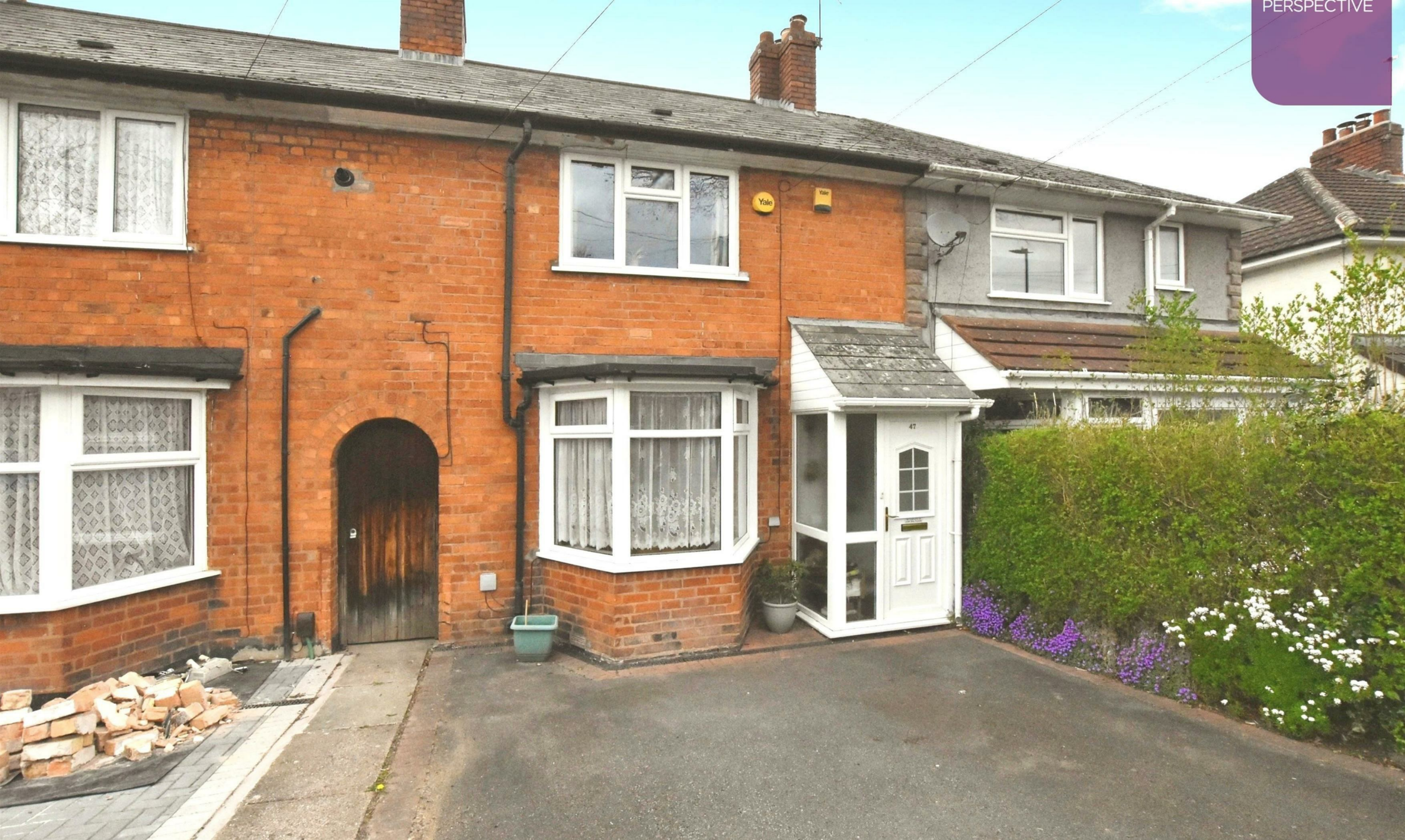
47 Greenoak Crescent, Birmingham, B30 2TD £250,000